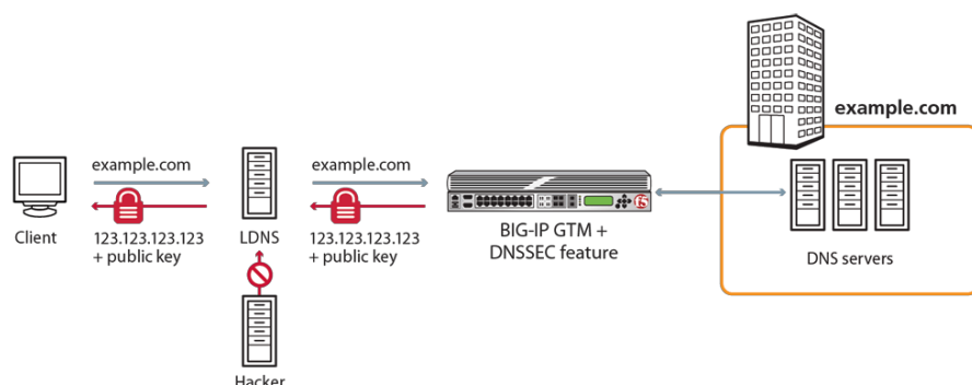
Figure 2: BIG-IP GTM DNSSEC feature interaction

This real-time signing is critical in dynamic content environments where both objects and users might be coming from various locations around the globe. There are other devices claiming DNSSEC for static DNS and DNSSEC compliance in general, but none of them has good solutions for dynamic content and none, so far, has any solutions for global server load balancing (GSLB)-type DNS responses in which the IP answer can change depending on the requesting client. Since GSLB can provide different answers to different clients for the same fully qualified domain name (FQDN), GSLB and DNSSEC are fundamentally at odds in the original design specifications. DNSSEC, as originally conceived, was focused solely on traditional static DNS and never considered the requirements of GSLB, or intelligent DNS. It's relatively easy to use BIND to provide DNSSEC for static DNS. It's more difficult to provide DNSSEC for dynamic DNS, and it's very difficult to provide DNSSEC for GSLB-type DNS responses, especially in cloud deployments. F5's general purpose DNSSEC feature provides DNSSEC covering all three scenarios and is simple to implement and maintain while keeping management costs low.