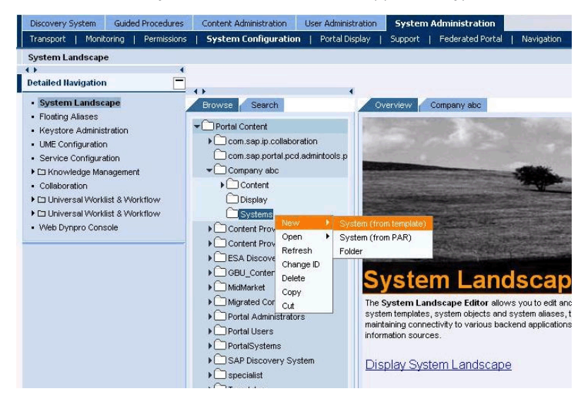
Figure 3: Creating a system